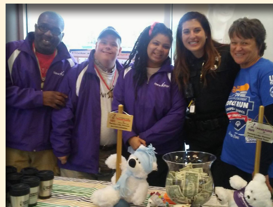
Some of our consumers and volunteers participated in Dunkin' Donuts' Annual "Cop on a Rooftop" fundraiser, benefiting Illinois Special Olympics!